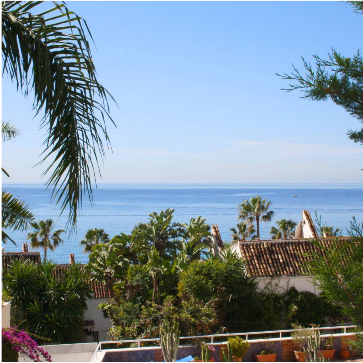
Property in Marbella